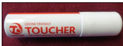
Toucher spray chalk $10.00