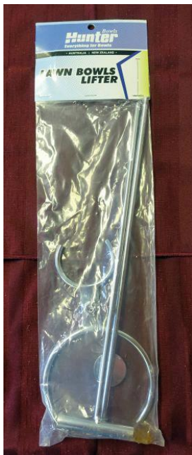
Bowl lifter $35.00