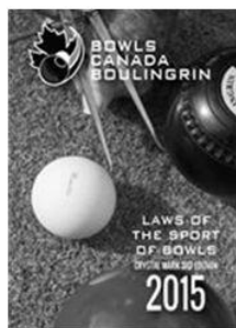
Laws of the Sport of Bowls, Crystal Mark, 3rd Edition, 2015 $5.00