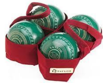
Lawn bowls carry slings $35.00