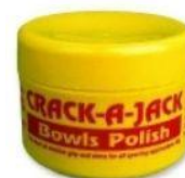
Crack-a-Jack (bowls polish and grip) $10.00