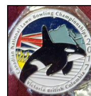
Pins Club, Bowls BC and 2017 National Championships $5.00