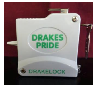
Tape measures (various) $35.00 to $50.00