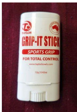
Grip-it-stick (organic grip) $18.00