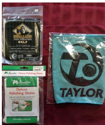
Bowl buffing cloths (various) $10 to $20