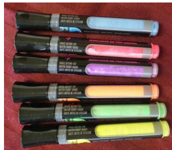
Chalk markers (various colours) $3.00

New bowls can be purchased from Shelley Sidel, Taylor Bowls agent for Vancouver Island